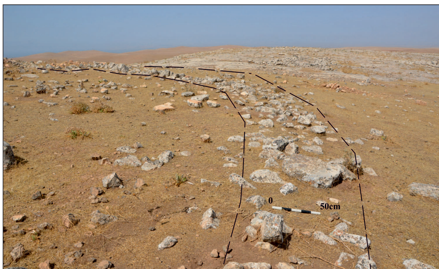
Fig. 5. View of the ruin of the round-plan building from the east.