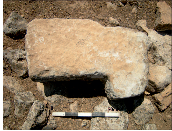
Fig. 11. An example of a broken pillar from Harbetsuvan Tepesi.