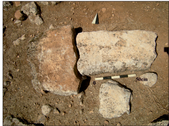
Fig. 4. An intact pillar at Harbetsuvan Tepesi.