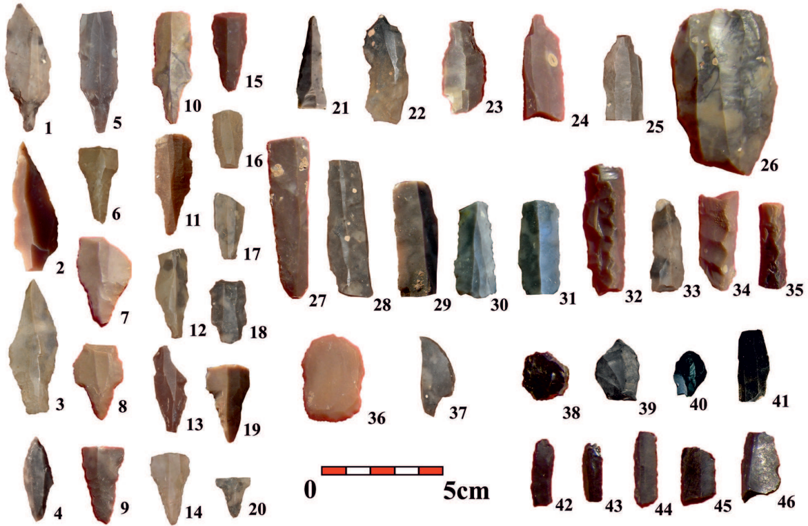
Fig. 10. Neolithic tools from Harbetsuvan Tepesi.