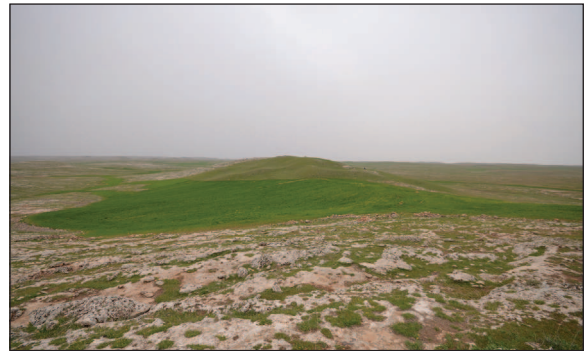
Fig. 2. View of Karahan Tepe from the east.