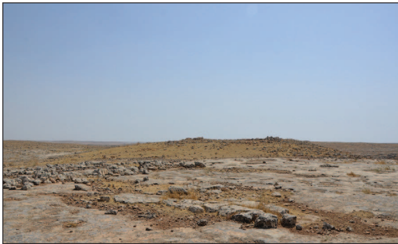
Fig. 1. View of Harbetsuvan Tepesi from the north.