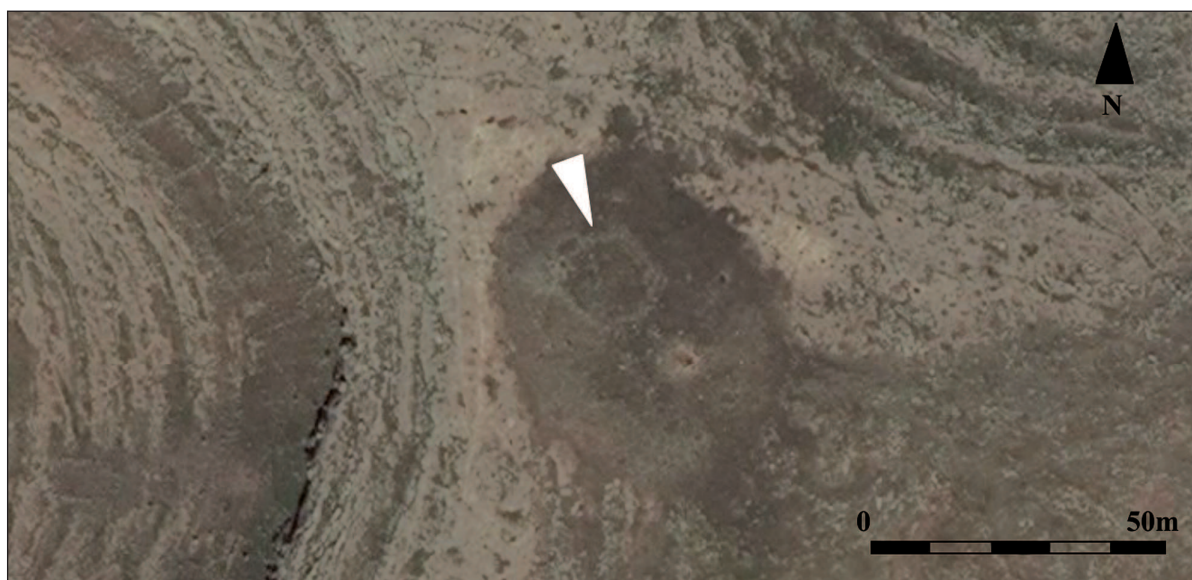
Fig. 6. Aerial view of the ruin of the round-plan building.