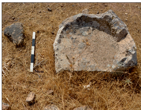
Fig. 7. Limestone vessel fragment from Harbetsuvan Tepesi.