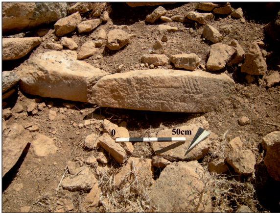
Fig. 3. The pillar with finger relief unearthed at Harbetsuvan Tepesi.