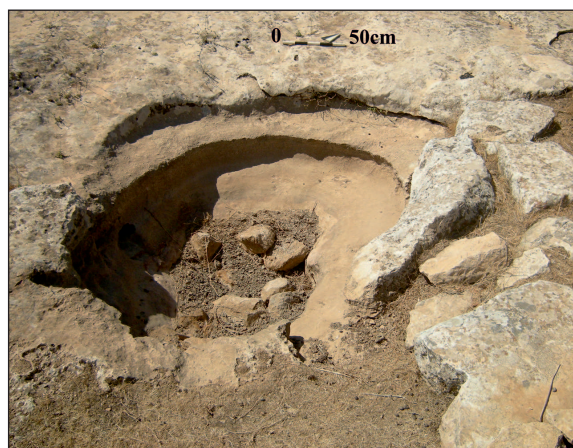
Fig. 8. Larger cavity carved out of the bedrock from Harbetsuvan Tepesi.