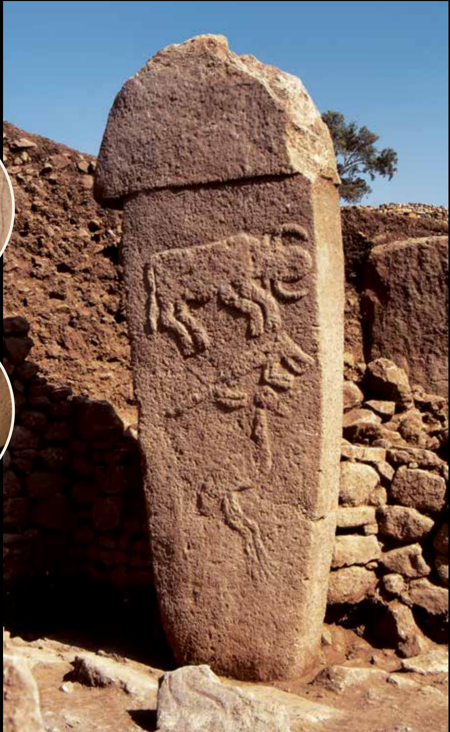
RIGHT: Pillar 2, the second central pillar of Enclosure A, shows an aurochs (a wild ancestor of domestic cattle), a fox, and a crane on one of its broadsides.