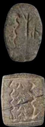
RIGHT: Aerial view of Enclosure D, showing two monolithic T-shaped pillars surrounded by smaller pillars. ABOVE: Two stone tablets from Göbekli Tepe, with stylized images that repeat and may have been "readable."