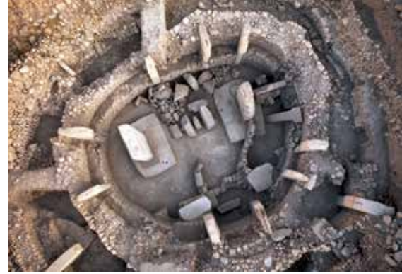
Aerial view of Göbekli Tepe's Enclosure C.

FINALLY, FIRST LIGHT SOUNDS THE BELL FOR THE WORKDAY TO BEGIN, THE SUN RISING JUST ABOVE THE EASTERN HORIZON. WORKERS AND ARCHAEOLOGISTS HEAD TO THE EXCAVATION TRENCHES, A CARAVAN OF SHOVELS AND BUCKETS, OF HEAD SCARVES AND HATS.