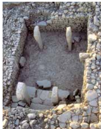
RIGHT: A rectangular building from an early layer (II) at Göbekli Tepe. Some of those buildings are very similar to Nevalı Çori's "cult building."

"October 1994, the land colored by the evening sun. We walked through slopy, rather difficult and confusing terrain, littered with large basalt blocks. No traces of prehistoric people visible, no walls, pottery sherds, stone tools. Doubts regarding the sense of this trip, like many before with the aim to survey prehistoric, in particular Stone Age sites, were growing slowly but inexorably. Back in the