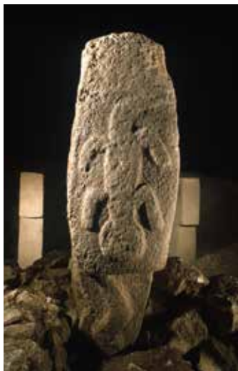
LEFT: Animal motif on Pillar 6 from Göbekli Tepe's Enclosure B.

view of a wide horizon. Still no archaeological traces, just those of sheep and goat flocks brought here to graze. But we had finally reached the end of the basalt field; now the barren limestone plateau lay in front of us....On