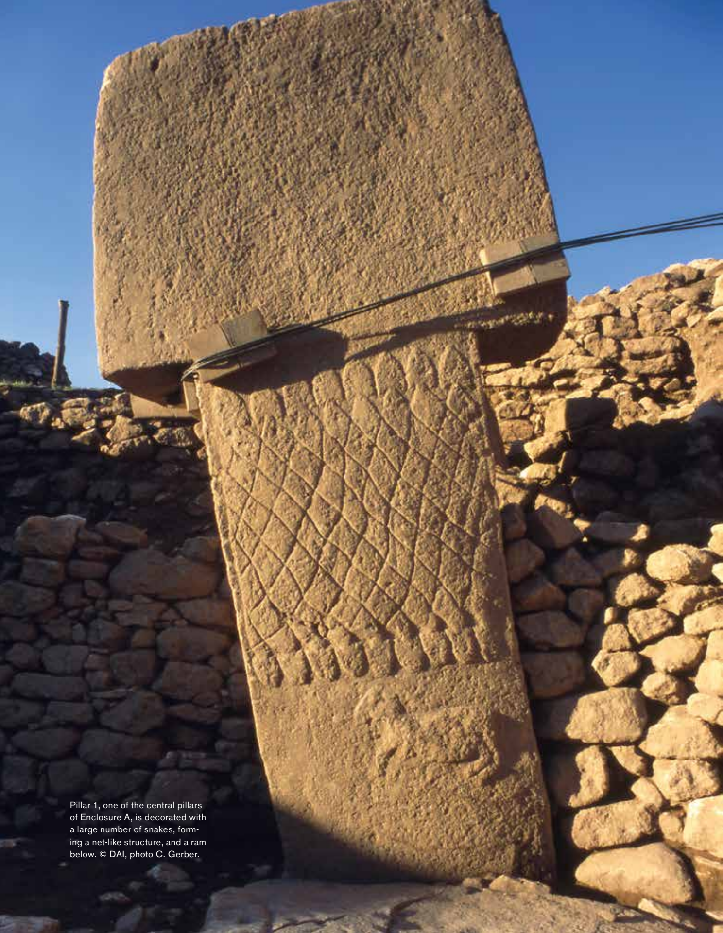
Pillar 1, one of the central pillars of Enclosure A, is decorated with a large number of snakes, forming a net-like structure, and a ram below.