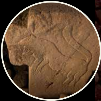
ABOVE: Stone reliefs of ducks and a fearsome male lion illustrate pillars.