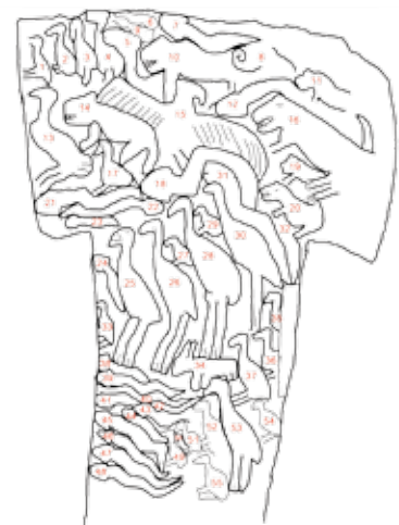
ABOVE: Pillar 56 in Enclosure H. Ducks, snakes, and a number of quadruped (four-legged) animals, most likely felids, are portrayed in the upper part. Between these, a large bird of prey can be spotted, clutching a snake in its claws. © DAI, photo and drawing N. Becker.

20 cm deep, which are, like the rest of the floor, carved out of the carefully smoothed bedrock. The central pillars demonstrate very well the human-like appearance of the T-shaped pillars. The oblong T-heads can be regarded as abstract depictions of the human head, the narrow side representing the face. Clearly visible are arms on the shafts with hands brought together above the abdomen (see page 10).