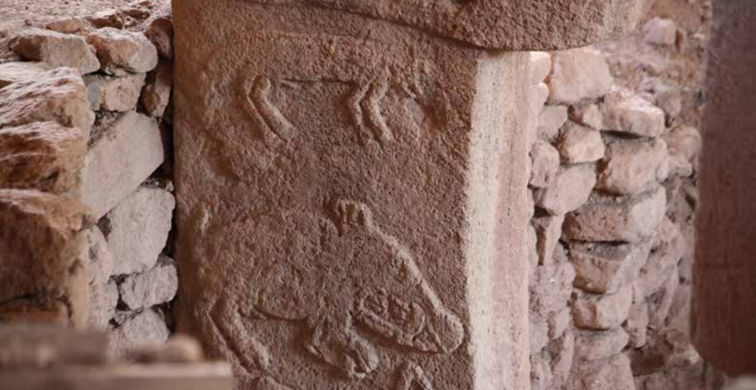
ABOVE: Stone pillar with relief sculptures of a male boar and quadruped from Göbekli Tepe.

the meaning of depictions like this remains unknown, it is clear that they exceed simple decorative purposes. The complex iconography hints at important mythological content.