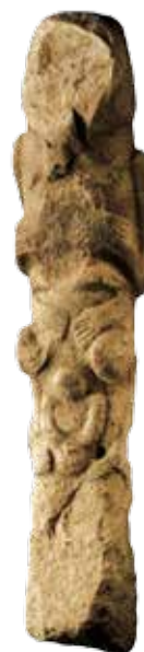
RIGHT: The Göbekli "Totem Pole," found in 2009, depicts animal arms and legs holding a human head at the top.

Enclosure D is the largest and best preserved so far. Two huge monolithic T-central pillars are surrounded by a circle formed of—at the current state of excavation—11 pillars. Most of these pillars show depictions of animals in flat relief: foxes, birds—such as cranes, storks, and ducks—and snakes are the most common species. The two pillars in the center, measuring about 5.5 m tall and weighing some 10 metric tons, were found on pedestals only