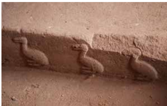
High relief of ducks in a line, from Göbekli Tepe.

A distinctive variation in the animal spectrum is depicted in each circle. While in Enclosure A, the snake prevails, in Enclosure B, foxes are dominant. In Enclosure C, boars predominate, while Enclosure D is more diverse, but strongly emphasizes birds. All depicted animal species are wild and no domesticates are attested in the archaeofaunal remains at the site. Göbekli Tepe clearly is a place of hunter-gatherers. But how could small hunter-gatherer groups with little hierarchy build such a