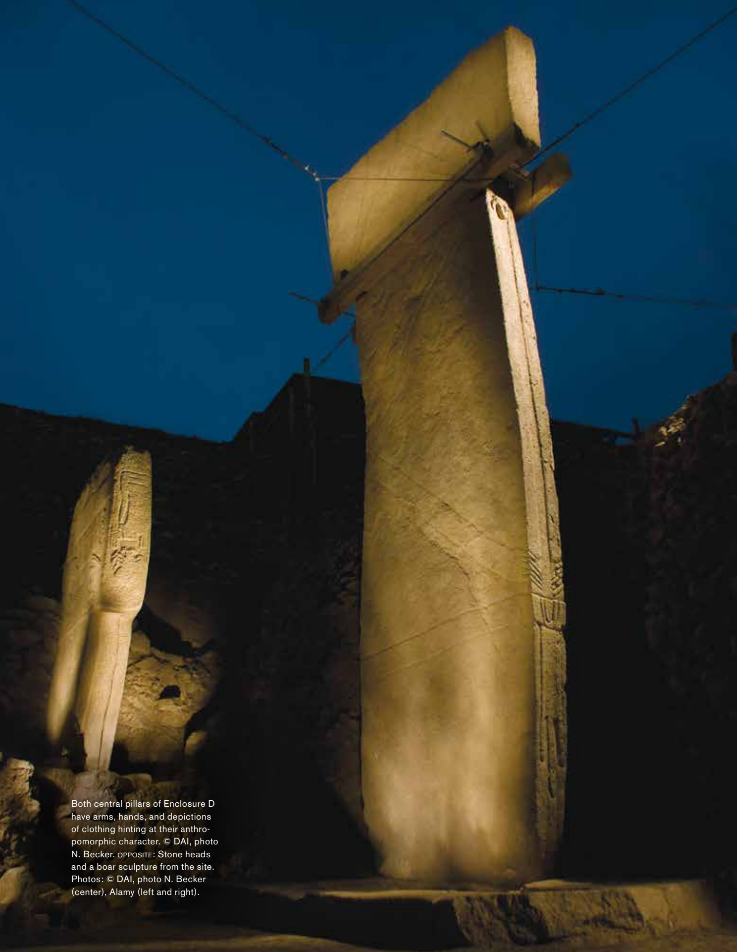
Both central pillars of Enclosure D have arms, hands, and depictions of clothing hinting at their anthropomorphic character. OPPOSITE: Stone heads and a boar sculpture from the site.