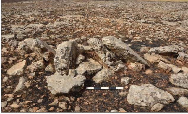
Picture 11: Detailed View of one of the Stones at K. Kösecik Village Snare Site.