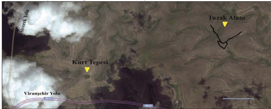
Picture 10: Satellite View of the Snare Site and Kurt Tepe Settlement.