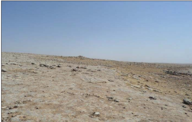
Picture 7: Bağışlar Village Suvan Tepesi Settlement, view from south.