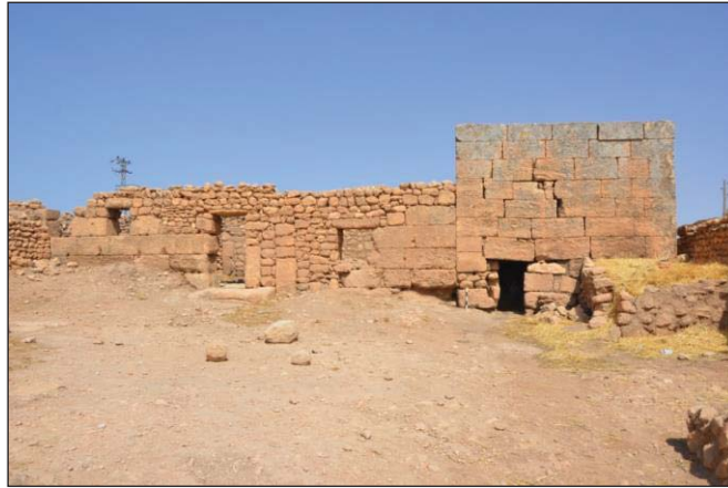
Picture 1: Örenli (Gıseyir) Village Architectural Structures, View from South.