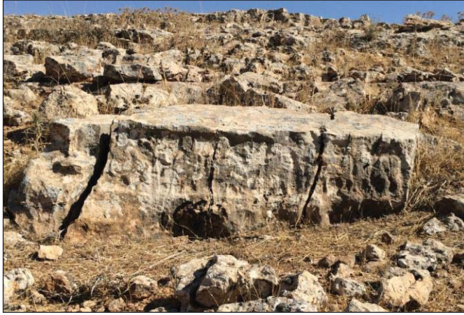
Picture 3: An Example for Reliefs at Dağyamacı Village East Locality Quarry.