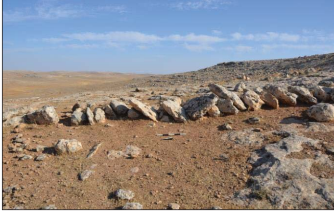
Picture 17: Wall Remains of Karakuş Village At Locality 2 Snare Sites.