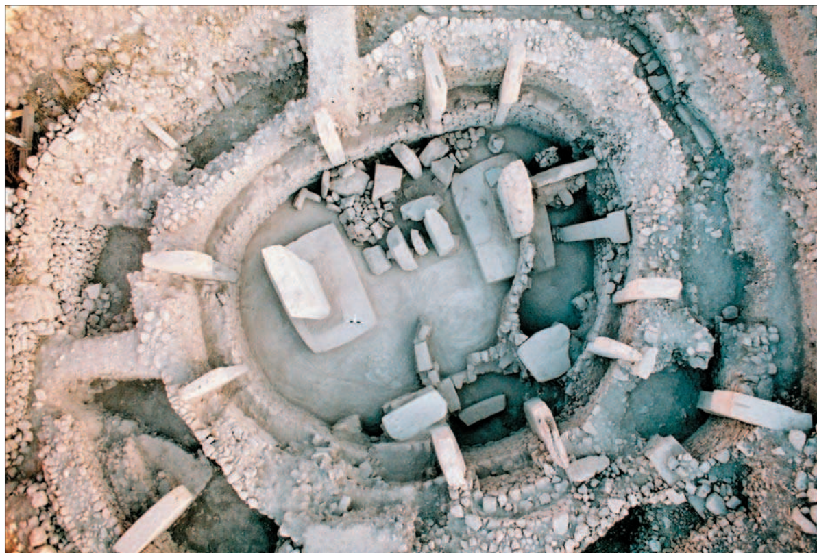
Fig. 22. Enclosure C with the two central pillars set on pedestals cut out of bedrock, autumn 2008.

hole stones were found scattered all over the mound during the survey of 1995 (Beile-Bohn et al. 1998. 45–47, Fig. 19 'Pfeilerbasis'). These objects were called 'portable pillar base' at that time because of the similarity observed between these objects and the two pedestals of the so-called 'rock temple', a structure cut out of the natural bedrock, now numbered as enclosure E (Schmidt 2006. Fig. 35). The pedestals have an oval tub-shaped hole in the middle of the object. Already in the first year of investigations, 1995, an explanation was given for them, which has now been confirmed: they were identified as the bases of the (now lost) central pillars of the rock temple. The function of the holes was reconstructed such that the lower part of the pillars was set in and fixed there. During the excavations of enclosure C in 2008 and enclosure D in 2009, both pairs of central pillars were found still in situ. Their bases are placed exactly in the way as the rock pedestals, as supposed in 1995 in the case of enclosure E (Fig. 22).