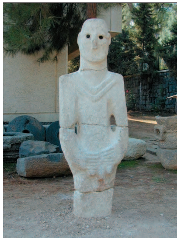
Fig. 14. The Urfa statue.

It is now clear that the T-shaped pillars have an anthropomorphic identity. But who are they? As their faces were never depicted, they seem to be imperson-