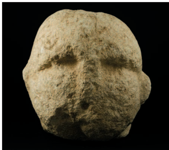
Fig. 19. Göbekli Tepe, life-size human head, limestone, height 23cm.

Urfa statue. The first was discovered in 1998 in the filling debris of a building complex which was erected in superposition to enclosure A (Schmidt 1999, Pl. 2, 1–2, Kat.-Nr. A5). Again, the mouth is not depicted. There are two other pieces, which are not well preserved (Kat.-Nr. A32, 50). The fourth life-size human head was discovered at Göbekli Tepe in spring 2010 in the filling debris directly east of pillar 31, the western central pillar of enclosure D (Fig. 19). It is broken at the neck, and there is damage around the mouth, but the rest of the head is preserved quite well. Its find spot can be understood as an offering of the head during the filling process of enclosure D. The life-size human heads from sites in the Urfa region are listed in Table 1.