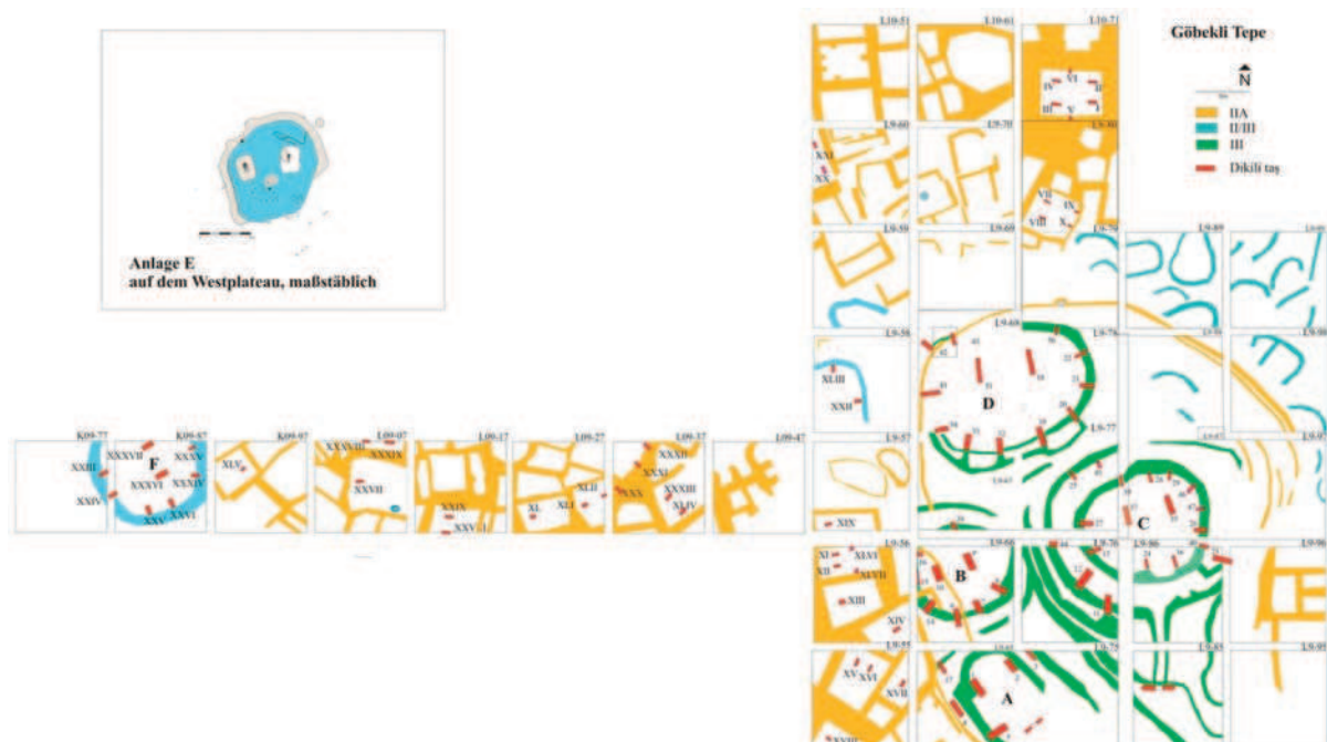
Fig. 2. Göbekli Tepe, schematic map of the main excavation area at the southern slope and the western hilltop, the stratigraphic position of the structures mapped in blue ("layer II/III") is not determined finally.

The younger layer of Göbekli Tepe has been dated to the 9 th millennium calBC. It has been demonstrated that some domesticated plants and animals were already in use during this millennium, and that elaborate settlements had been built, such as Nevalı Çori, which lies 50 kilometres to the north, a site now submerged by the flooding of the Atatürk Dam Lake in 1992 (Hauptmann 1991/1992; 1993). The excavation caused a sensation in the 1980s, as it opened for the first time a new window on a previously unexpected world of Stone Age culture. The type of dwelling excavated at Nevalı Çori, with a living space in front and a rectangular area behind for storing provisions may be considered the proto-