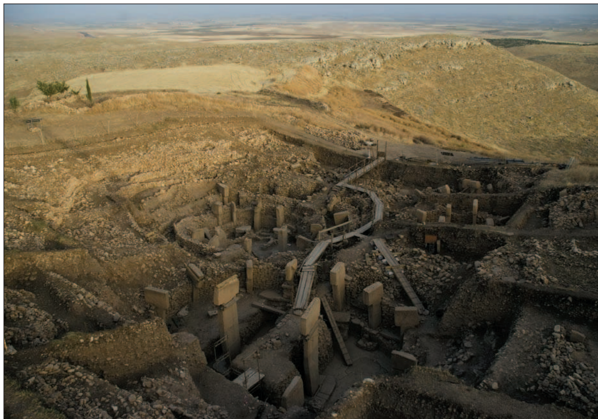
Fig. 3. The main excavation area at the southern slope, spring 2010; in the foreground, enclosure D, followed by enclosures C, B and A.

type of the Anatolian farm house that can still be found today. Even then, the houses were up to 6 metres wide and 18 metres long.