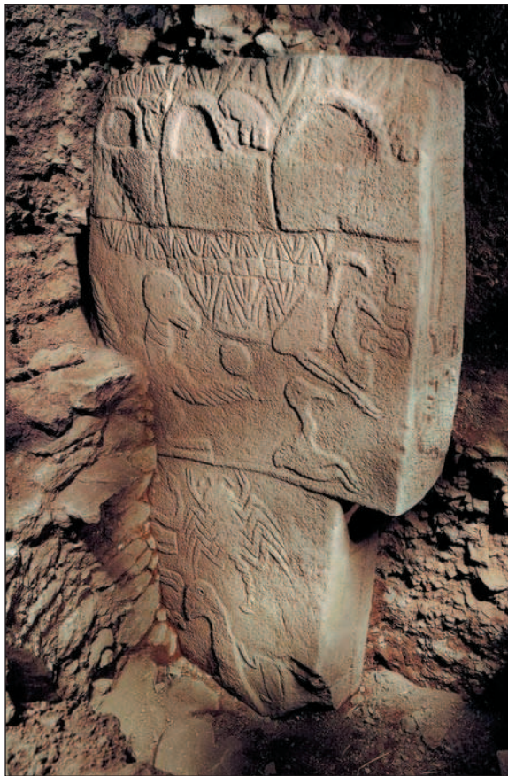
Fig. 10. Pillar 43 in enclosure D.

The T-form of the pillars can easily be interpreted as anthropomorphic, as some of the pillars appear to have arms and hands, undoubtedly human; they are, in other words, stone statues of human-like beings (Schmidt 2006.Fig. 43a). The head is represented by the cross on the pillars, an interpretation supported by a pillar from Nevalı Çori, where a longer face section and a shorter back of the head are observable, corresponding to the natural proportions of the