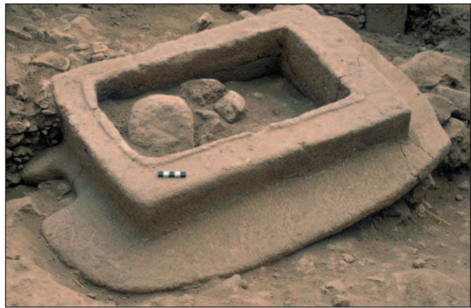
Fig. 21. Porthole stone from enclosure B.

The discovery of a so far unknown megalithic enclosure in the new excavation areas on the north-western hilltop was in fact not really a surprise, as it is known that geophysical methods do not map structures buried deep below the surface. The single monumental pillar found in this area was nearly 1m below the surface. Other pillars which can be expected to belong to the structure have not been discovered, which obviously can be explained by the suggestion that the missing pillars and walls are buried quite deeply. Therefore, they remained invisible in the geophysical record.