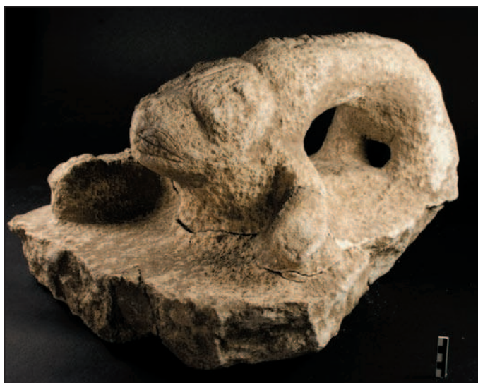
Fig. 25. High relief of a predator on a stone slab, probably part of the rim of a porthole-stone, from the bulk west of enclosure D, length 53cm.

The transitional period of the late Pleistocene to the early Holocene in south-western Asia saw the emergence of the first large, permanently settled communities. Permanent settlements dating to 12 000–10 000 BP currently under excavation are producing unexpected monumentality and extraordinarily rich symbolism that challenges our ability to interpret. Especially in Upper Mesopotamia, in the centre of the so-called Fertile Crescent, large sites with exciting finds have been unearthed in recent years. The results of these recent and ongoing excavations have not turned our picture of world history upside down, but they are adding a splendid and colourful new chapter between the period of the hunters and