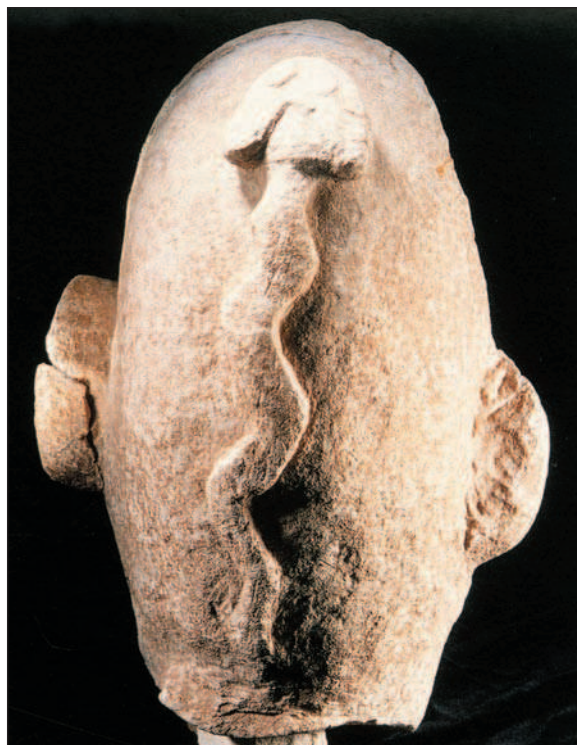
Fig. 15. The 'skin head' from Nevalı Çori (after Hauptmann, Schmidt 2007.Kat.-Nr. 96).

nal supernatural beings from another world, beings gathered at Göbekli Tepe for certain, so far unknown, purposes. Their identity is obviously different from that of the several life-size and more or less naturalistically depicted human heads found at Göbekli Tepe. On the basis of the one completely preserved limestone statue found at Urfa, not Göbekli Tepe, which is male and dates to the Early Neolithic, it seems that the limestone heads are most probably statues of male personages (Bucak, Schmidt 2003; Schmidt 2006.Fig. 93) (Fig. 14). This completely preserved, 1.80m tall limestone sculpture was discovered in the 1990s in the old town north of the Balıklıgöl, where an important Islamic sanctuary is located. According to a local tradition, the prophet Abraham was born in a cave near the springs and lakes nearby. Several observations attest to a PPNA site north of the springs (Çelik 2000) which was destroyed by immense construction works in the 1990s or sealed by the old town of Urfa in medieval times. Fortunately, at least the statue survived; it is a find whose provenance from the PPNA site of Balıklıgöl mentioned above has a very high probability.