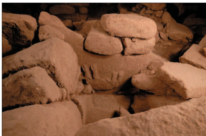
Fig. 26. Fragmented portholestone with the relief of a boar depicted side down; the stone slab is defining the entrance into the “Dromos” south of enclosure C.

The evolution of modern humanity involved a fundamental change from small-scale, mobile hunter-gatherer bands to large, permanently co-resident communities. Following the ideas of Trevor Watkins, to whom I am grateful for long discussions and much inspiration on this subject, we observe that Jacques Cauvin's suggestions were correct (Cauvin 1997): the factor that allowed the formation of large, permanent communities was the facility to use symbolic culture, a kind of pre-literate capacity for produ-