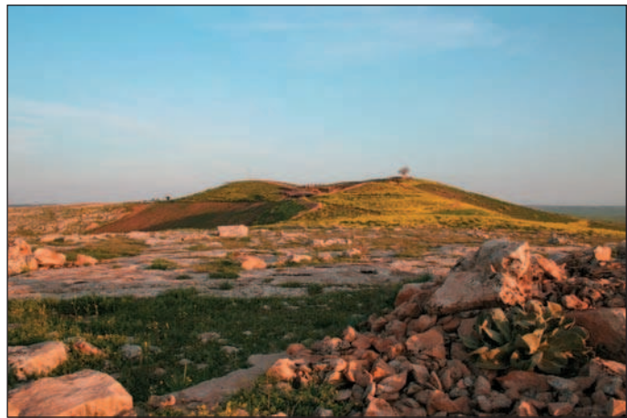
Fig. 1. The site of Göbekli Tepe seen from the southeast in 2009.

main features are T-shaped monolithic pillars, each weighing several tons. They were erected to form large circular enclosures, at the centre of which a pair of these pillars towers over all (Fig. 2). The diameters of the circles are between 10 and 20 metres, and the ten to twelve pillars of the circle are connected by walls of quarry stone (Fig. 3). The enclosures have been designated A, B, C and D in a range according to the date of their discovery in the first years of the excavations. Later, enclosures E, F and G were added, but they do not show the monumentality of the other four, and these later enclosures are not discussed fully in this paper.