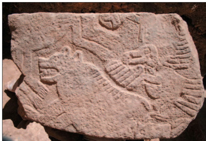
Fig. 11. Fragment of a decorated pillar found in the debris of enclosure D, north of pillar 18.

It was no surprise when hands and fingers soon became visible, but a few hours later a sensational discovery was made: both pillars were wearing belts depicted in flat relief just below the hands. A belt buckle is visible in both cases, and on the eastern pillar, there are decorations on the belt in the form of H- and C-shaped figures (Fig. 9). However, there is an even more interesting feature: a loincloth covering the genital region hangs from each of the belts (Fig. 8) – the hind legs and tail of what appear to be fox pelts are visible. The loincloth covers the genital region, so the sex of the two individuals is unclear, but since the several clay figurines with belts found at the Pre-Pottery Neolithic site at Nevalı Çori are all male (Morsch 2002.148, Pl. 3, 3–4.6), it seems highly probable that the pair of statues in enclosure D are also male.