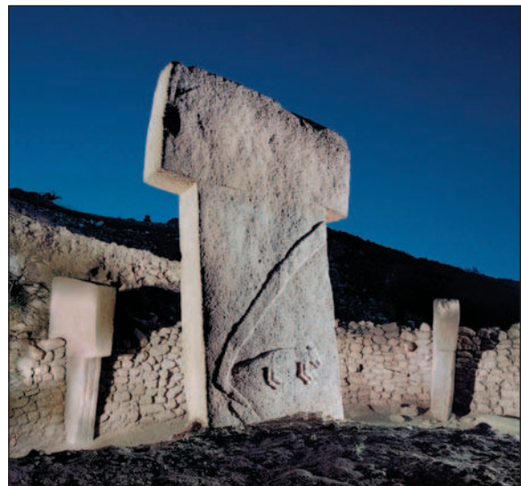
Fig. 6. Göbekli Tepe 2006, pillar 18 in enclosure D.

There are no domesticated animals or plants. The enclosures date to the period of transition from hun-