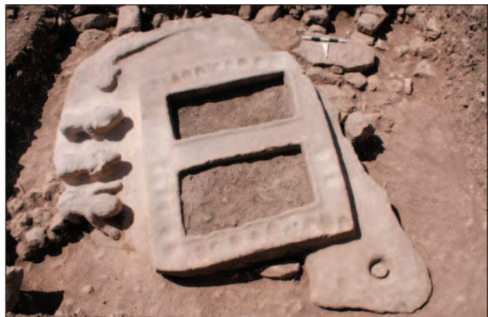
Fig. 24. Huge porthole-stone in situ in new excavation area on the north-western hilltop of the mound, depicted scale 0.5m.

It is not the first time that animals have been found depicted on the rim of a porthole stone at Göbekli Tepe. There are several fragments with reliefs, but the motifs are quite small, or the preservation of the surfaces was so poor that there remained doubts as to whether a relief was present; it is possible that the form in question was not an image, but an irregularity in the stone.