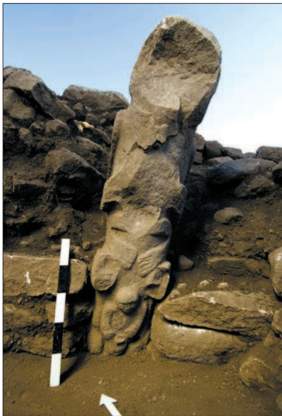
Fig. 18. A ‘totem pole’ from Göbekli Tepe, excavated in October 2010.

A similar situation is visible on a second object: another large bird (again, probably a vulture, but the