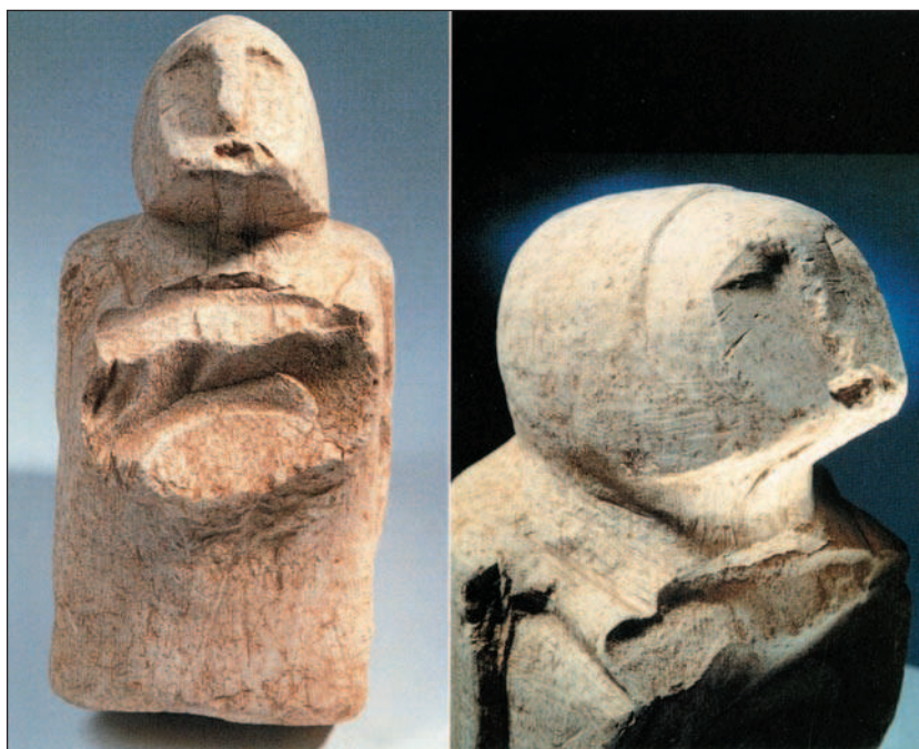
Fig. 12. Nevalı Çori, sculpture of a bird with a human face (after Hauptmann, Schmidt 2007.Kat.-Nr. 98).

These reliefs open a view of a new and unique pictorial language not known before whose interpretation is a matter of important scientific debate. So far as can be seen, the mammals depicted are male. It remains a mystery whether the relief images were attributes of the pillars, or whether they were part of a mythological cycle. They may have had a protective aspect, serving as guards, or – perhaps more