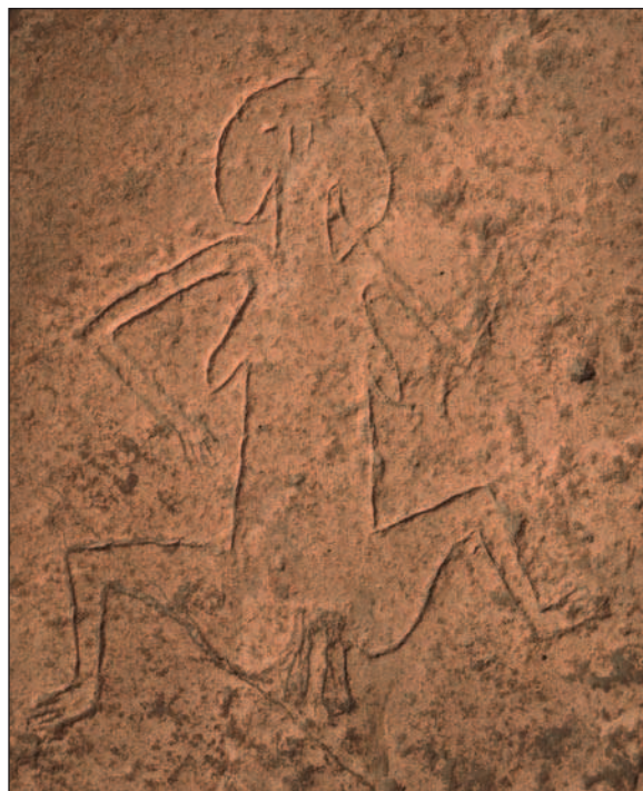
Fig. 13. Göbekli Tepe, engraving of a female person from layer II.

probably – are part of a horrific scenario somewhat like Dante's 'Inferno'.