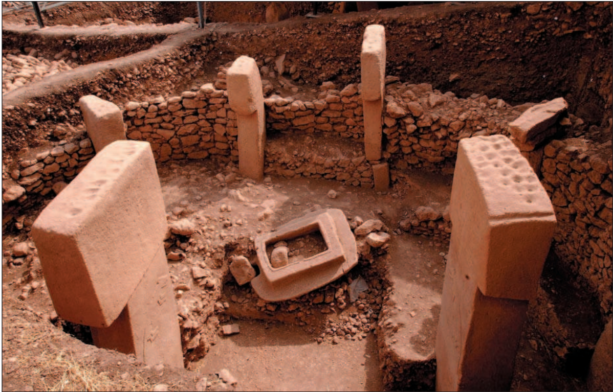
Fig. 23. Enclosure B and its portholestone in centre.

ctangular openings. But this so far unique double porthole is not the only astonishing feature. On the southern rim is a flat relief of a very large snake. On the western rim there are high reliefs of three animals. In a direction from south to north, a bull, a billy-goat and a predator showing its teeth are positioned. A high relief with a very similar animal was found in the same season in the northern profile of a trench in the west of enclosure D (Fig. 25). Again, the tail of the beast is curved at its back. The repetition of the motif underlines the observation that there was a fixed canon of depictions which was unveiled step by step and year by year.