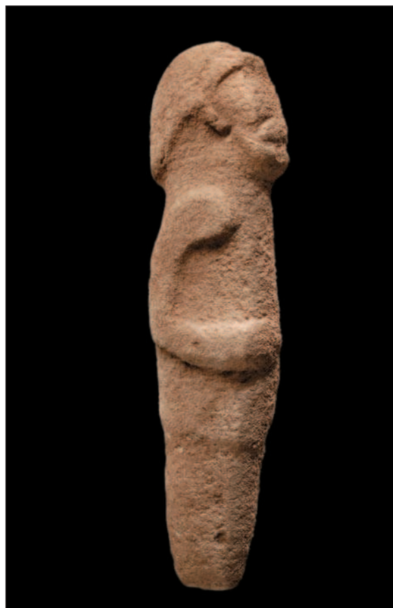
Fig. 20. Göbekli Tepe, sculpture of a man with beard, limestone, height 66cm.

But the layer II structures did not cover the eastern row of the new trenches. Under surface layer I – a layer characterized by dark humous sediments produced by farming on the site – a brownish-grey sediment appeared. It included a lot of limestone gravel, but almost no stones larger than fist size. Such sediment is typical of the filling debris of the enclosures of layer III. Expectations that a structure of Layer III lay below the filling were soon justified, as the upper part of a megalithic pillar was found, to all appearances in situ. There is no question that this pillar is part of a so far unknown enclosure that had not been detected by geophysical investigations in previous seasons (Schmidt 2009b). What is not clear is the extent and orientation of the new structure.