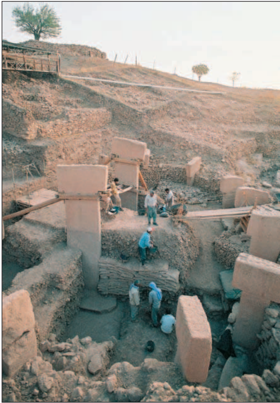
Fig. 4. Enclosure D seen from the west in autumn 2009 during preparation work for the consolidation of the upright stand of the central pillars.

noted (contact with fire would help to preserve some of the organic materials by carbonisation, but almost no carbonised material has been found).