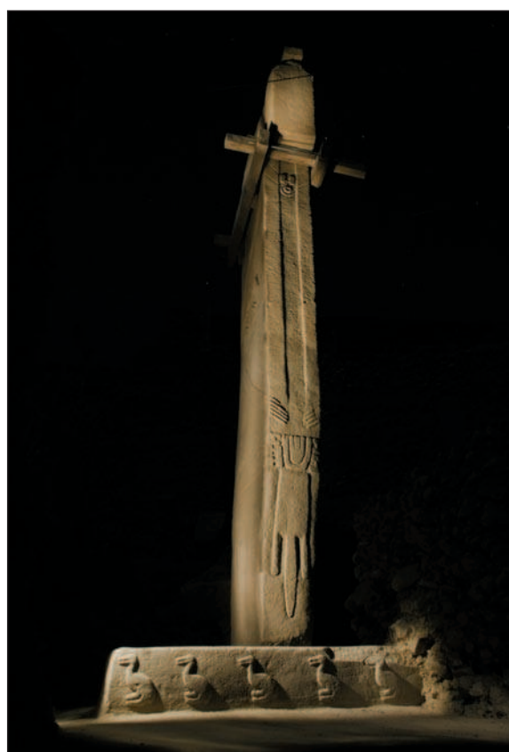
Fig. 8. Pillar 18, the eastern central pillar of enclosure D, after being raised into an upright position in spring 2010, height 5.4m.

ached in enclosure C and D, which has been under excavation for over ten years. A terrazzo floor was predicted, as such a floor had been excavated in enclosure B. But in both enclosures the floor was natural bedrock, carefully smoothed. As in enclosure E – the so-called ‘Felsentempel’ located outside the mound at the western plateau – two pedestals, where a central pair of T-shaped pillars were erected, were cut out of the bedrock in the centre of both enclosures C and D. But unlike enclosure E, where no pillars or walls survived the millennia, or enclosure C, where the central pillars were destroyed in antiquity, both central pillars in enclosure D survived with no damage, and with a breathtaking height of 5.5m, having stood in situ for more than 11 000 years. There is only a small problem regarding their stability, as slope pressure has caused the pillars to shift into a slightly oblique position. Without support or – much better, without the re-erection of both pillars into a vertical and stable position – both would fall down after the removal of the surrounding sediment which covered the enclosure completely before excavation, being the result of the backfilling process during the PPN period. The stabilisation of both pillars – work began in 2009 – was one