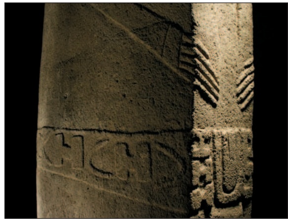
Fig. 9. The decorated belt of pillar 18 seen from the southwest in spring 2010.

human head (Hauptmann, Schmidt 2007.80) (Fig. 5). Differentiation of the sexes was evidently not intended. It is also clear that the minimalist form of representation was intentional, because other statues and reliefs found at the site offer sufficient proof of the artists' ability to produce naturalist works.