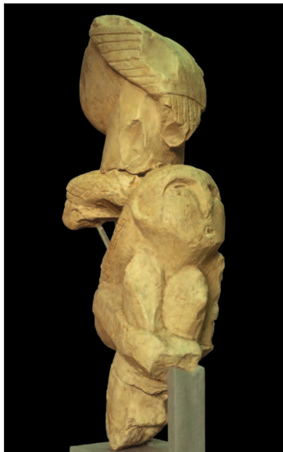
Fig. 16. The 'totem pole' from Nevalı Çori (after Hauptmann, Schmidt 2007.Kat.-Nr. 101).

The so-called 'skinhead' discovered at Nevalı Çori (Hauptmann 1991/1992.Fig. 23) (Fig. 15), a life-size human head with a snake atop recalling the Egyptian Uraeus snake which protects the pharaoh, seems to belong to a similar statue. Unfortunately, the face was deliberately destroyed some time in the Neolithic. The remaining part of the head was used as spolia in the northern wall of the terrazzo building, where T-shaped pillars were discovered in the 1980s (for the first time in the world). The snake clearly underlines the importance of the person, but as the skinhead was found in the wall of the terrazzo building, with its T-shaped pillars, it seems most probable that the status of the person depicted by the sculpture is much below that of the T-shaped pillar-statues.