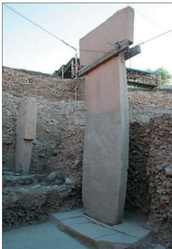
Fig. 7. Pillar 31, the western central pillar of enclosure D, after being raised into an upright position in spring 2010, height 5.3m.

ter-gatherer to farmer societies during the 10 th and 9 th millennia in the Near East.