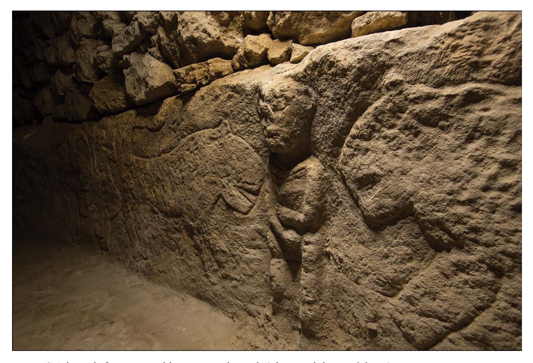
Figure 6. The male figure situated between two leopards.