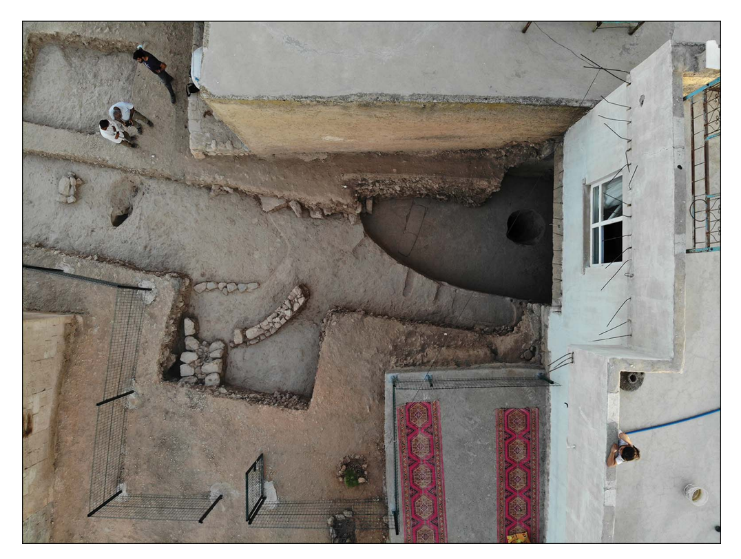
Figure 2. The position of the communal building, located between two buildings in the northern part of the village of Sayburç.

are carved in flat relief. The direction and stance of the figures imply that two related scenes are present. While the other figures are facing one another, only the male figure—in high relief—faces into the room, staring into the interior. This principal human figure holds its phallus in its right hand (Figure 5). It is comparable with the Neolithic human figures discussed by Müller-Neuhof (2019: tab. 2). The rounded protrusions on the upper end of the legs appear to represent the knees, as if bent forward while sitting, and provide perspective. Although the head is damaged, a round face, large ears, bulging eyes and thick lips are evident. In particular, a triangular-shaped necklace or neckband is notable. This male figure is faced on each side by two leopards (Figure 6), which are depicted in profile. Their mouths are open, the teeth visible, and their long tails are curled up towards the body. The leopard to the west is depicted with a phallus, whereas the other is not.