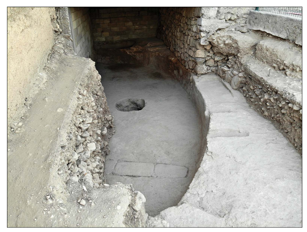
Figure 3. Extent of current excavations: only half of the communal building has been excavated to date.