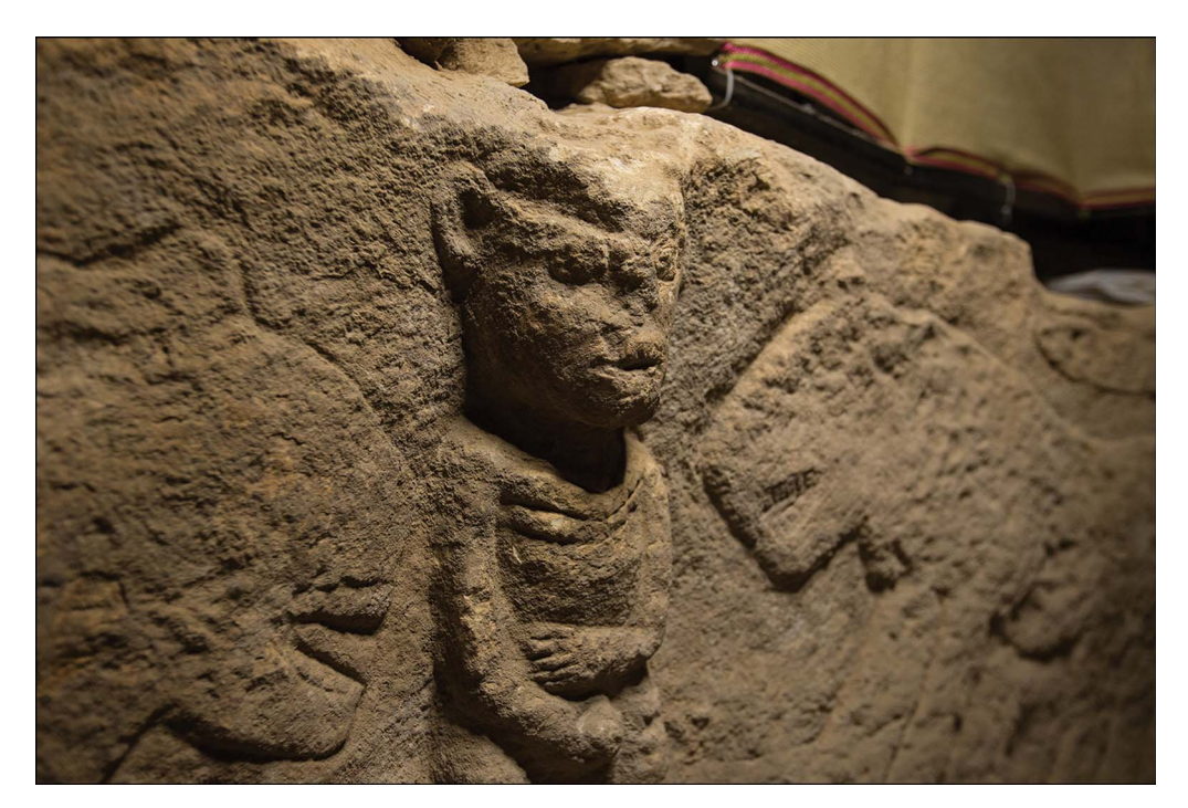
Figure 5. The male figure in high relief.