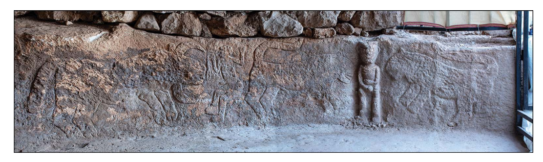
Figure 4. The Sayburç relief.

deliberately chosen to emphasise the horns, which are exaggerated like the leopards' teeth in the previous scene.